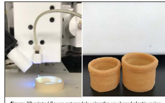
Figure: 3D printed flower pot models using the soy-based plastic resins

proteins. This bio-plastic formulation is cost-effective, easy to manufacture, and an excellent alternative to traditional petroleum-based plastics. This new plastic can be used in small and large-scale manufacturing of everyday items of varying shapes and sizes such as cutlery, containers, packaging items, carpets, small medical devices as well as have agricultural use in seeding stripes, flower pots, mulching and irrigation systems, to name а Biodegradable or "Green" plastics have tremendous market potential,